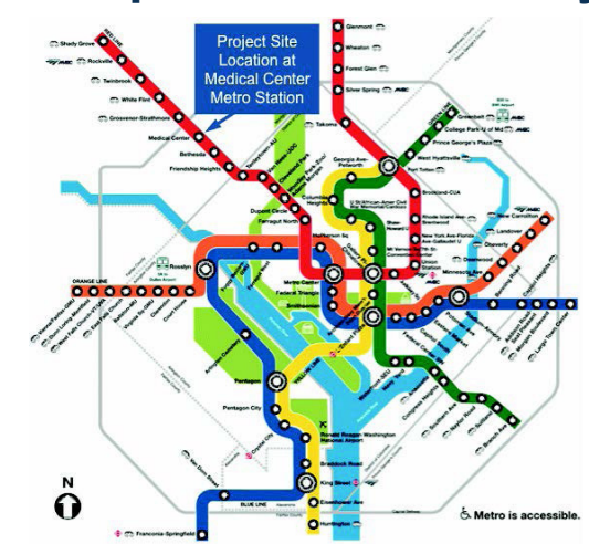
Figure 1. WMATA system map.