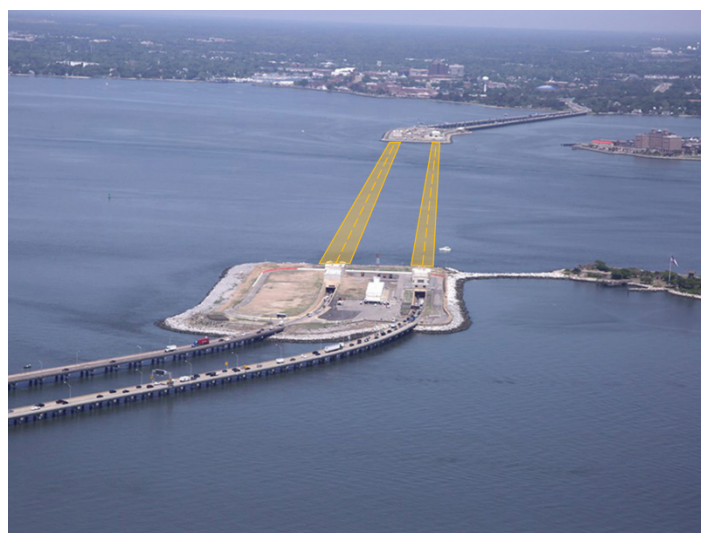
Figure 2. Existing Hampton Roads Bridge-Tunnel with Island Approach Structures and Tunnel alignment indicated by Highlighted Path.

Gall Zeidler Consultants (GZ) is providing independent design verification (IDV) services for the tunnel and tunnel approach structures for Mott MacDonald (MM).